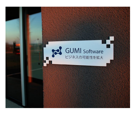
POP displays and sign engraving