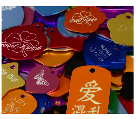
Pet and dog tags engraving