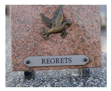
Funeral plaques and headstones engraving