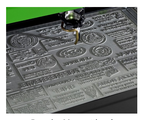
Engraving & laser cutting of custom ink stamps