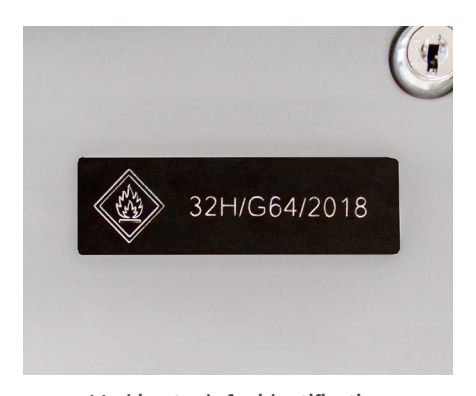
Marking tools for identification and equipment traceability