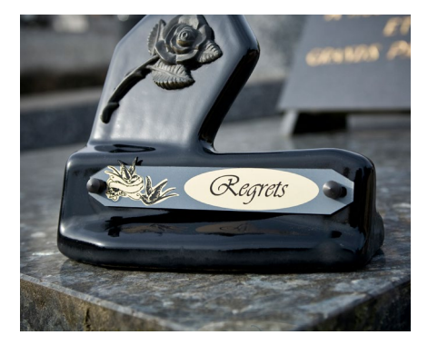
Funeral plaques and headstones engraving